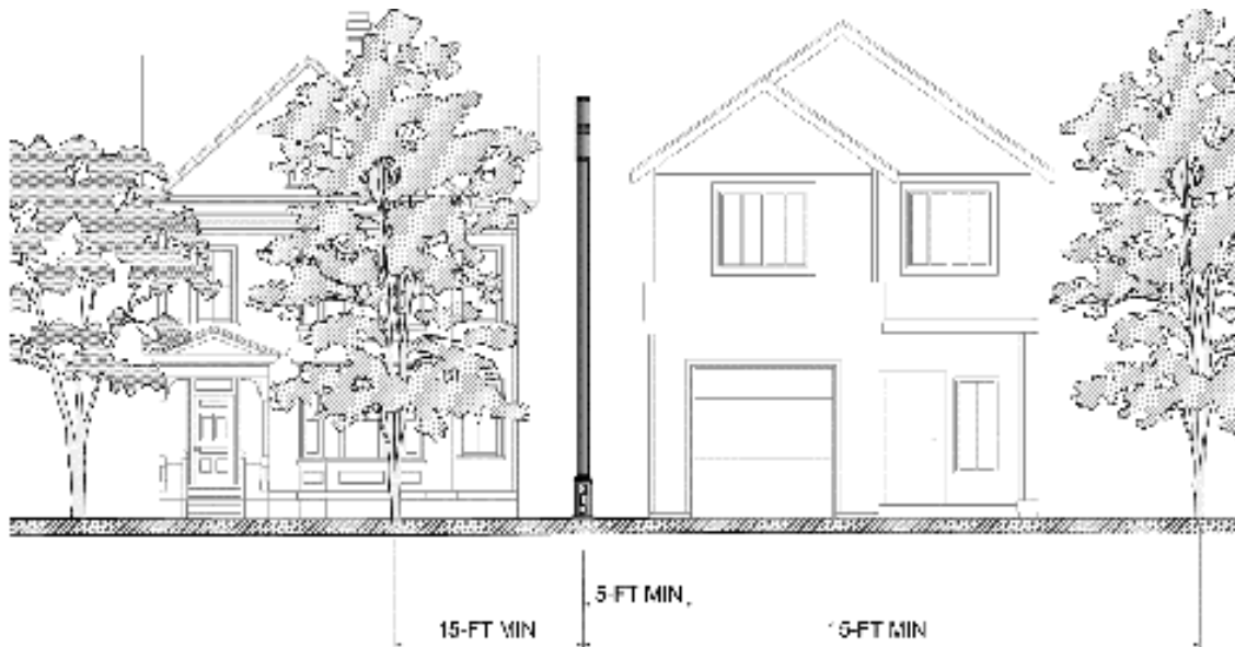
Figure 1 – Example of Acceptable Location Between Residential Homes: